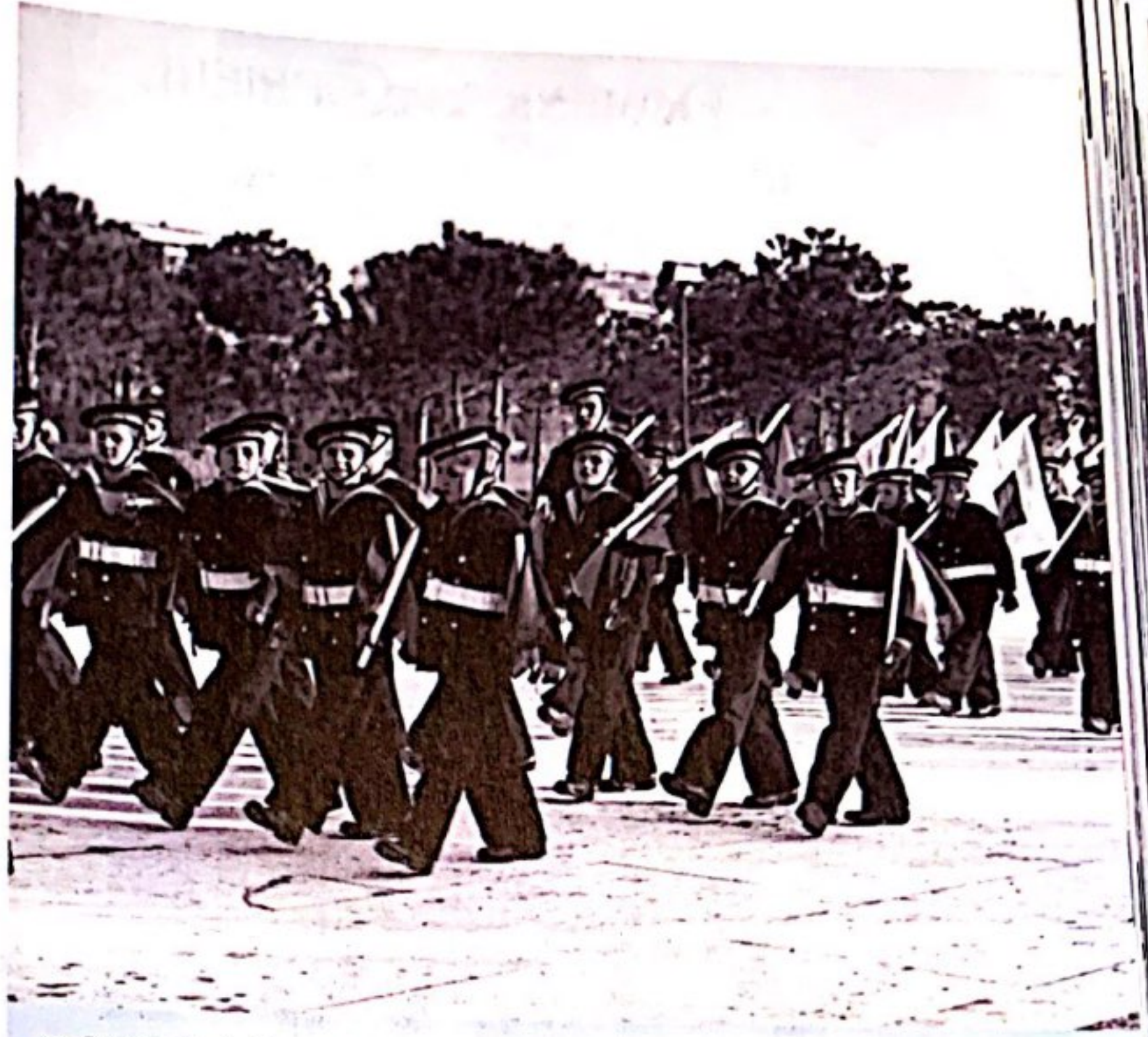
>> Mussolini viewed children as the Fascists of the future and took great interest in education and the youth program. Boys were taught to be strong soldiers and girls were taught to be strong, nurturing mothers.

Historians still debate the real nature of Mussolini's fascist ideology. Mussolini coined the term, but fascists had no unifying theory as Marxists did. Today, we generally use the term fascism to describe any centralized, authoritarian government that is not communist whose policies glorify the state over the individual and are destructive to basic human rights.