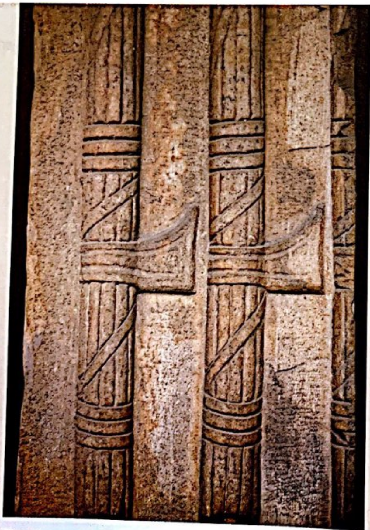
>> The fasces, a bundle of sticks wrapped around an ax, was an ancient Roman symbol of unity and authority. Fascists adopted the name and symbol for their party.

Control by Terror Mussolini organized his supporters into "combat squads." The squads wore black shirts to emulate an earlier nationalist revolt. These Black Shirts , or party militants, rejected the democratic