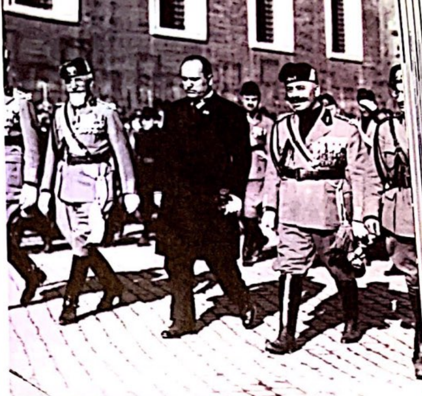
>> Mussolini and the National Fascist Party led the March on Rome in October 1922. Fewer than 30,000 men participated in the march, but the king feared a civil war and asked Mussolini to form a cabinet.

8.6 "I hated politics and politicians," said Italo Balbo. Like many Italian veterans of World War I, he had come home to a land of economic chaos and political corruption. Italy's constitutional government, he felt, "had betrayed the hopes of soldiers, reducing Italy to a shameful peace." Disgusted and angry, Balbo rallied behind a fiercely nationalist leader, Benito Mussolini. Mussolini's rise to power in the 1920s served as a model for ambitious strongmen elsewhere in Europe.