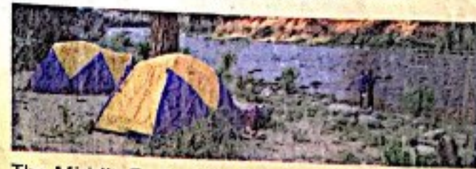
The Middle Fork of the Salmon River was one of the original eight rivers designated as wild and scenic in 1968.

Long-term impact: By late 2006, the system covered 11,358 miles of river.