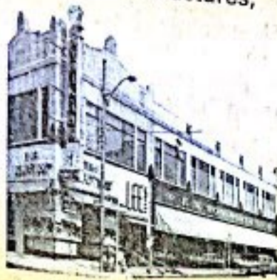
The nationally registered F.W. Woolworth Building, Greensboro, N.C., is the site of the first civil rights lunch counter "sit-in" in 1960.

Long-term impact: More than 79,000 places were registered as historic sites by the beginning of 2006.