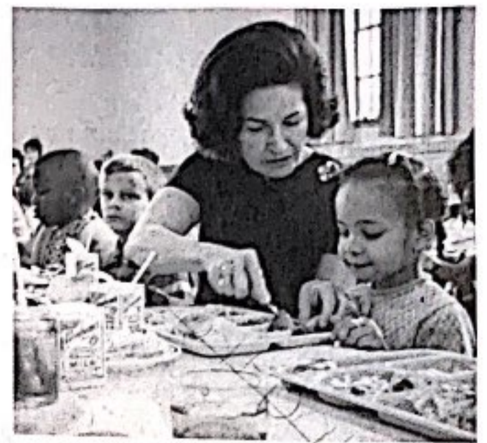
President Johnson's wife, Lady Bird, helped promote his Great Society programs. As part of the effort to beautify America, she helped coordinate the planting of wildflowers along highways. She also took an interest in children and education.

That same year, Johnson signed an act creating the National Endowment for the Arts (NEA) and the National Endowment for the Humanities (NEH). These organizations give grants to artists, musicians, writers, scholars, and researchers to promote a vibrant national culture. Johnson also spearheaded passage of the Public Broadcasting Act of 1967. "While we work every day to produce goods and create new wealth," he explained upon signing the act, "we want most of all to enrich man's spirit. That is the purpose of this act." The act established the Corporation for Public Broadcasting (CPB), which supports the development of public radio and television programs. One of the first CPB-funded shows was Sesame Street , which first aired on public television stations in 1969.