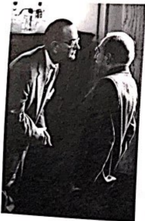
Here Lyndon Johnson puts the "Johnson treatment" to work on Senator Theodore Green. The president would lean in close, coming face to face with the person he addressed. Energetic in his speech, facial expressions, and hand gestures, Johnson used this treatment to persuade legislators to vote in his favor.