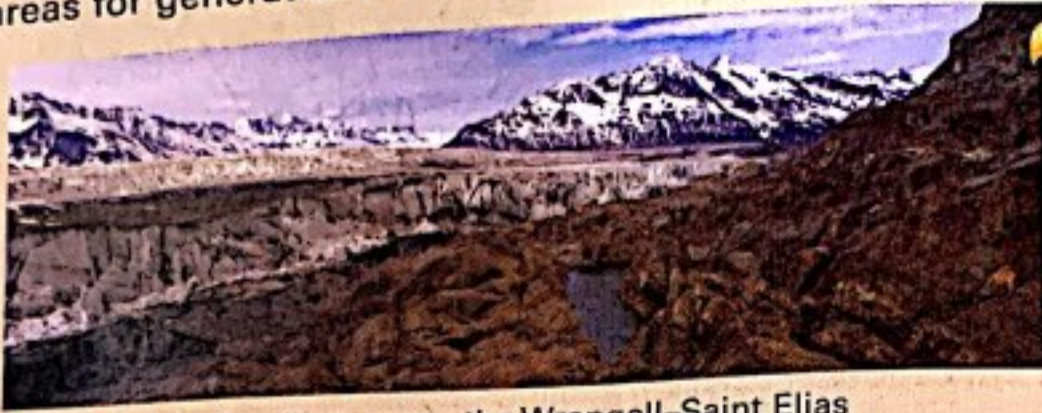
At more than 9 million acres, the Wrangell-Saint Elias Wilderness in Alaska is the nation's largest wilderness area.

Long-term impact: Nearly 107 million acres of land were preserved as wilderness areas by the end of 2006.